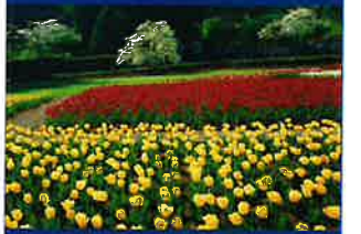
One of the Biltmore's many gardens.