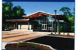
The Blue Ridge Parkway Visitor Center.