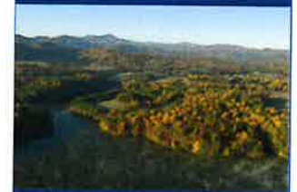
View the Blue Ridge Mountains.

Day 4: Today after enjoying a Continental Breakfast, you depart for home... A perfect time to chat with your friends about all the fun things you've done, the spectacular sights you've seen and where your next group trip will take you!