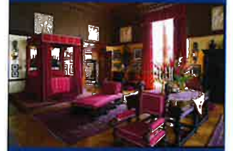
Grand Victorian architecture.